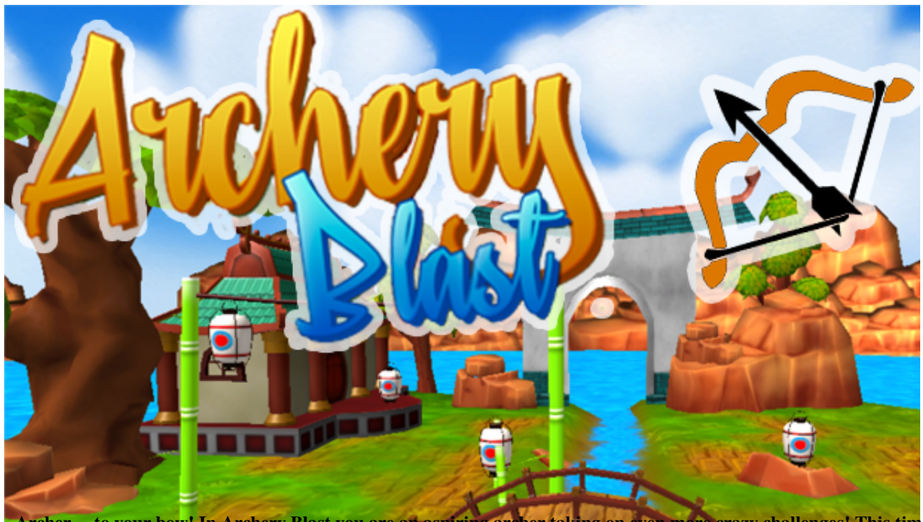
Archer ... to your bow! In Archery Blast you are an aspiring archer taking on even more crazy challenges! This time there are 60 challenges waiting for you! You will be able to buy 2 new bow with the coins that you will gain in levels. Will you manage to overcome it? Attention ... Fire!